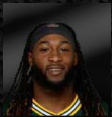
AARON JONES RB, Green Bay Packers