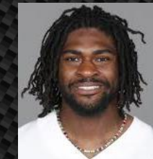
TREVON DIGGS CB, Dallas Cowboys He was drafted by the Cowboys in the second round of the 2020 NFL Draft and has been with the team since. Diggs had a standout season in 2021, leading the NFL with 11 interceptions and earning First-Team All-Pro honors.