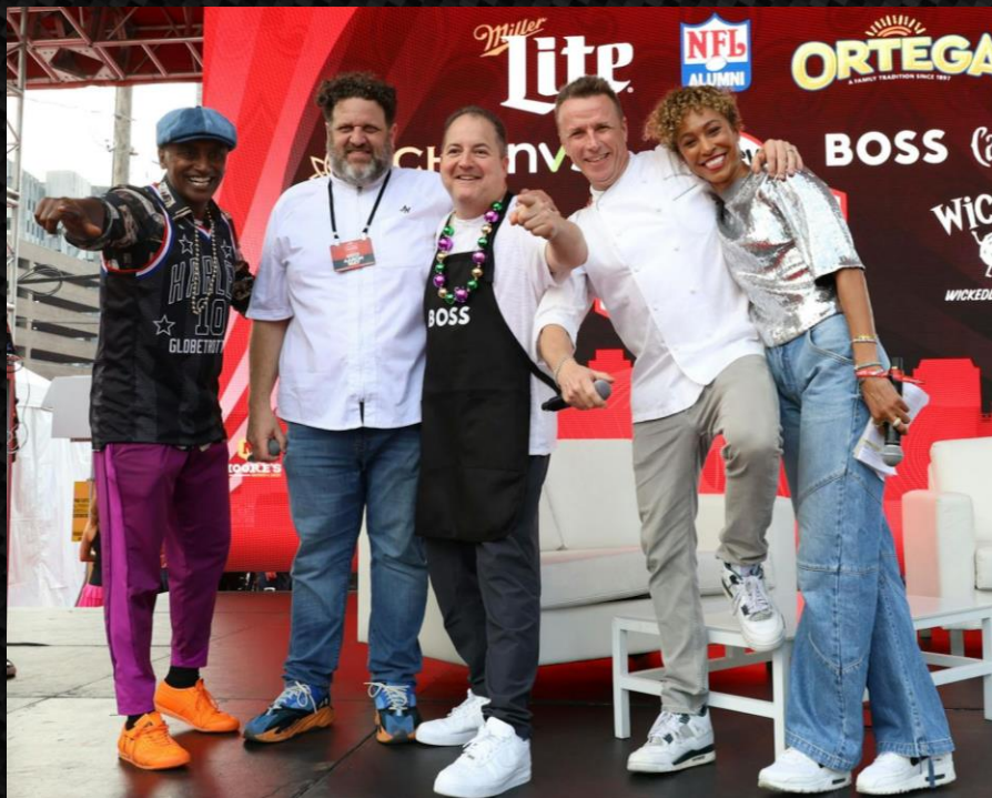
Marcus Samuelsson, Josh Capon, Marc Murphy & Sage Steele