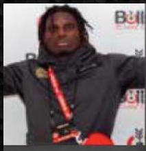
TYREEK HILL WR, Miami Dolphins