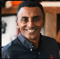
2026 HOST CHEF MARCUS SAMUELSSON