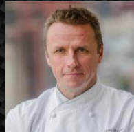
2026 HOST CHEF MARC MURPHY