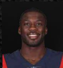
NELSON AGHOLOR WR, Baltimore Ravens