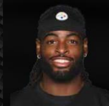
NAJEE HARRIS RB, Pittsburgh Steelers