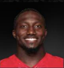
DEEBO SAMUELS WR, San Francisco 49ers