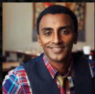
2026 HOST CHEF MARCUS SAMUELSSON

The youngest person ever to receive a three-star review from The New York Times. He has won eight James Beard Foundation Awards. He is a longstanding judge and TV personality on the hit Food Network show Chopped, head judge of Top Chef. Marcus Samuelsson is the esteemed chef behind many restaurants worldwide.