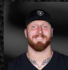
MAXX CROSBY DE, Las Vegas Raiders