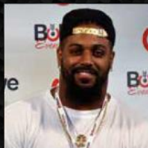
CAMERON JORDAN DE, New Orleans Saints