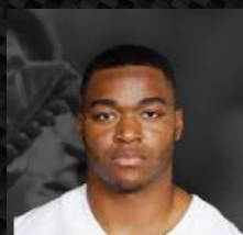
AMARI COOPER WR, Cleveland Browns