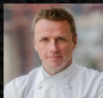
2026 HOST CHEF MARC MURPHY

The youngest person ever to receive a three-star review from The New York Times. He has won eight James Beard Foundation Awards. He is a longstanding judge and TV personality on the hit Food Network show Chopped, head judge of Top Chef. Marcus Samuelsson is the esteemed chef behind many restaurants worldwide.