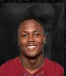
TERRY MCLAURIN WR, Washington Commanders