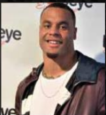
DAK PRESCOTT QB, Dallas Cowboys